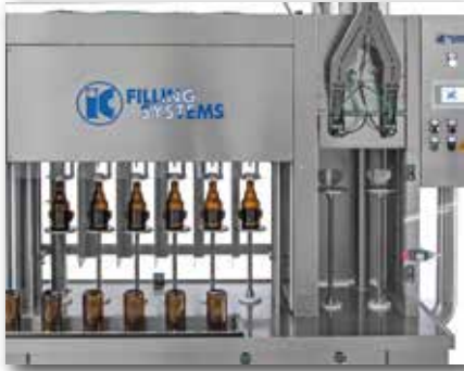
General view of bottling