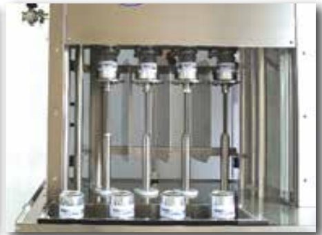
General view of canning